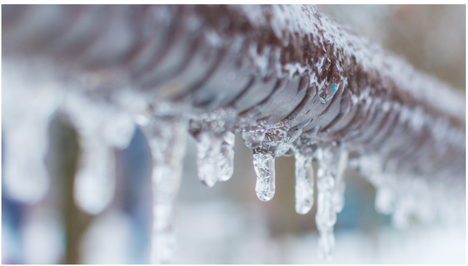
Texas's winter storm, which left millions without power and nearly 15 million with water issues, could be the costliest disaster in state history.

In response to the 2021 Texas power crisis, Federal Disaster Declarations have authorized the use of FEMA funds to support emergency response and hazard mitigation projects across the state. Two types of federal funds — Public Assistance (PA) and the Hazard Mitigation Grant Program (HMGP) — will be available to counties, municipalities, utilities, and other eligible entities to support infrastructure response, recovery, and disaster mitigation projects.